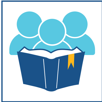
A) Peer-Reviewed Articles