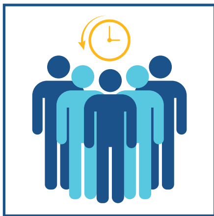
D) Retrospective Studies